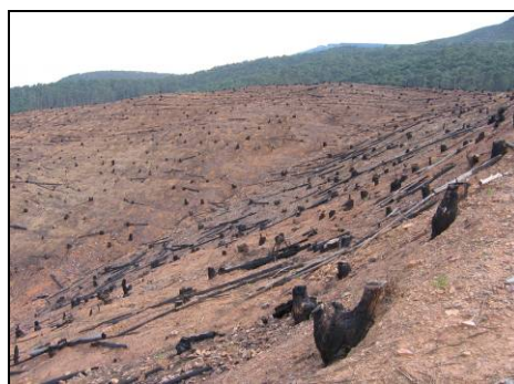
Large timber monoculture (left); FSC certified timber plantation after clear cutting (right).

According to Wally, development of agrofuels would not benefit consumers in the South, but only those in the North. The time has come for people to look at their own behaviour. Northern countries have to be prepared to look at the overall environmental and social costs of their consumption patterns. There is a lot of waste in European countries that can be used to produce biofuels. Tree plantations in South Africa are sometimes called a green cancer.